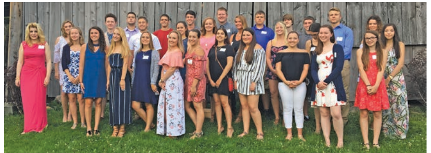
2017 Scholarship Recipients at the first ever Sullivan County Scholarship Reception held on July 17 at The Arnold House.

Over 300 scholarship recipients, family members and community volunteers came together to celebrate the Community Foundation’s annual Scholarship Receptions held in early July. The receptions celebrate the achievements of local high school graduates and enable awarded students to meet the donors and fund representatives who make their scholarships possible. Since 2000, funds under the Community Foundation’s charitable umbrella have awarded more than $2 million in scholarships to local, deserving students continuing their education. This year alone, scholarship funds administered by the Community Foundation distributed more than $400,000 to 178 students from 41 different school districts throughout the region.