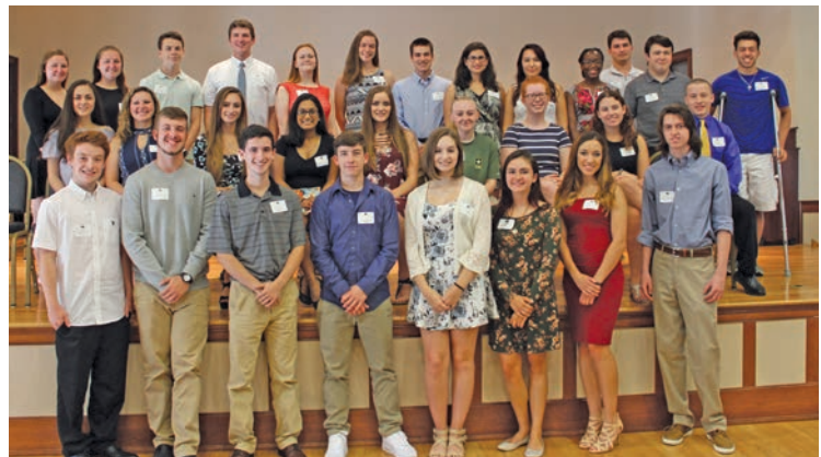
2017 Scholarship Recipients at the annual Scholarship Reception held on July 27 at the Village of Montgomery Senior Center.

“When you learn, teach. When you get, give.” Maya Angelou