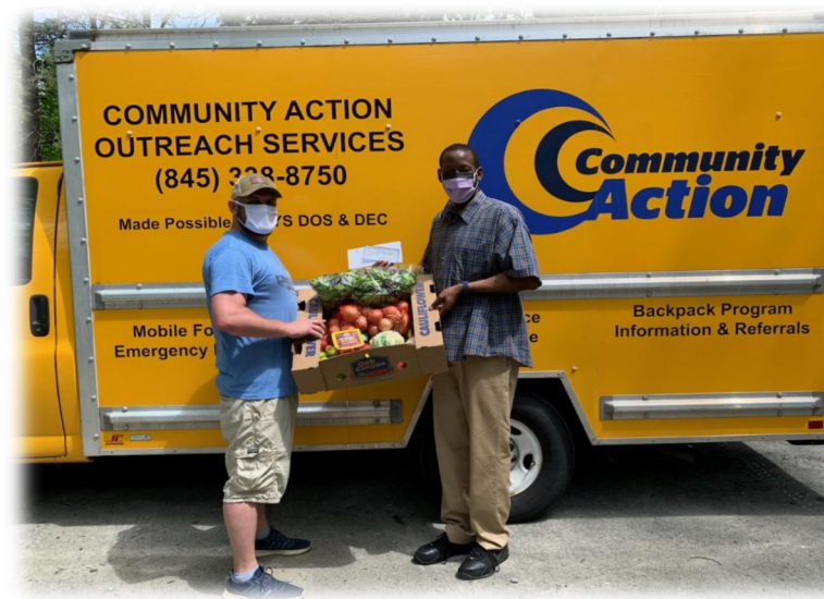
United Way Sullivan put its grant into action.

When the pandemic hit, the Community Foundation of Orange and Sullivan (CFOS) quickly launched the Orange and Sullivan COVID-19 Response Fund to address immediate and