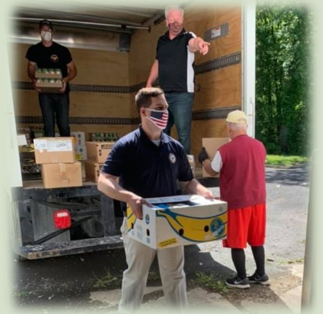
The TOMStrong Fund is providing critical response in Montgomery.